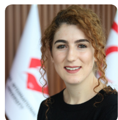
Rigersa Cara Albania